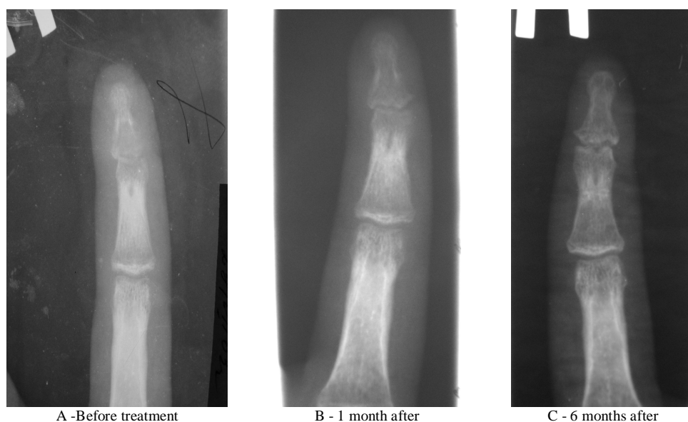
Fig. 2. Roentgenographs of patient L, 14 y.o., with osteoarticular panaritium.

In patients with osteoarticular panaritium, laser osteoperforation facilitated fast regeneration of the bone structures, forming the joint, and also partial or complete regeneration of joint space (Fig. 2.).